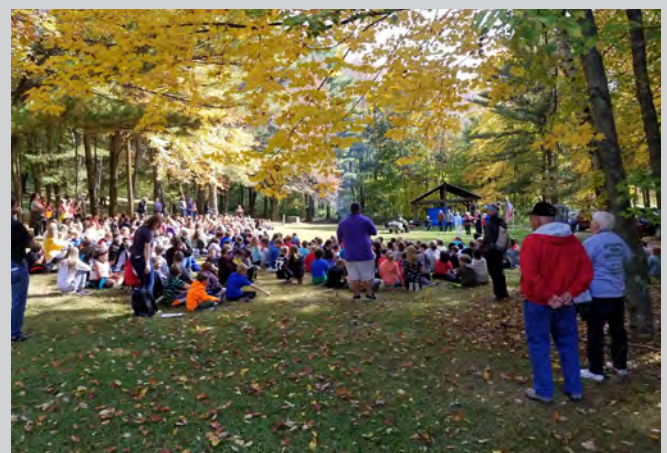
Students attend a Flag Retirement Ceremony in 2022.