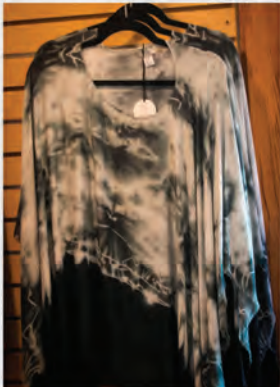
Black Tie Dye Poncho 1089 $43.95

Hoodie with flying eagle and mission statement. Available in Heather Royal, Heather Navy and Sand.