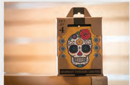
Coaster - Sugar Skull 3002 $12.95

Handmade 12 oz. mug crafter right here in Wisconsin. Perfect for coffee, hot chocolate or soup. Available in three colors.