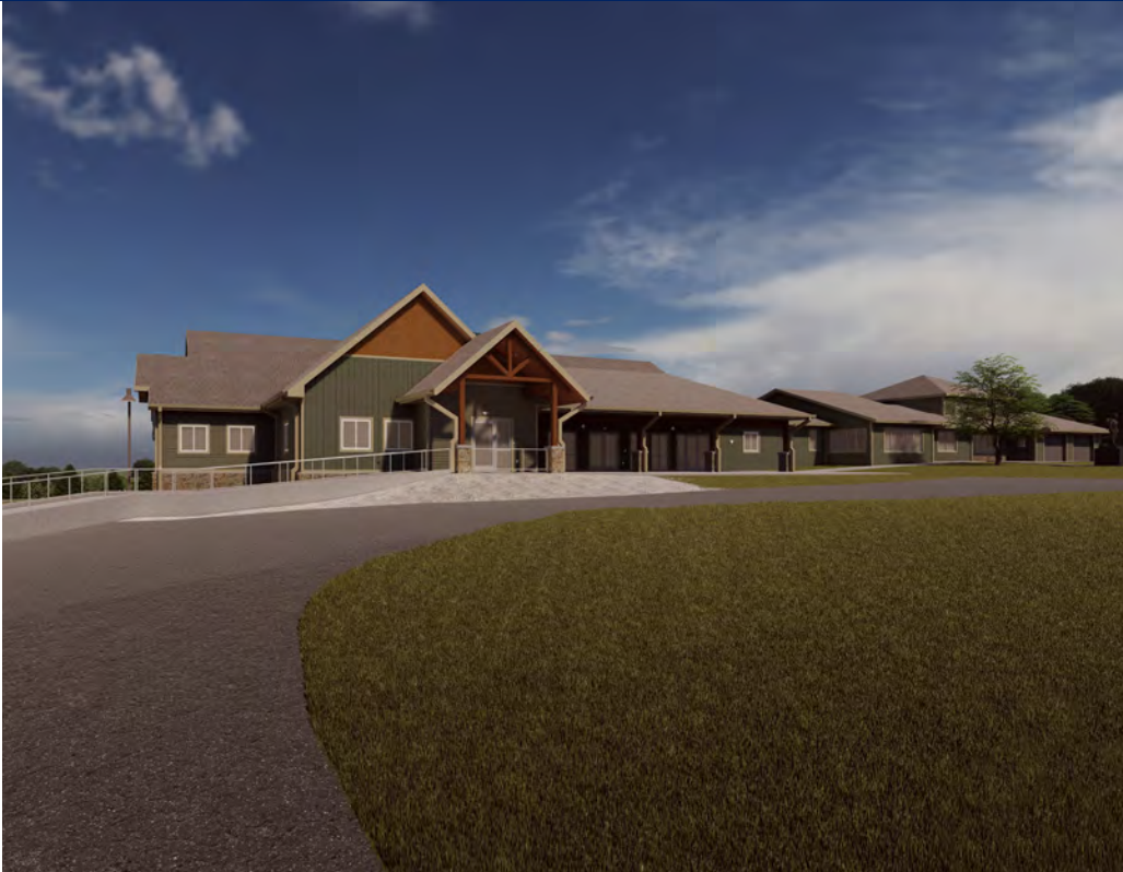
A rendering of what the new building will look like. See page 12 for additional illustrations.