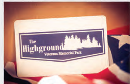
HG Gift Card The perfect gift for anyone and any occasion. Available in any amount.

Set of four coasters, two each of: Sugar skull rose and sugar skull cross. Made from absorbent stoneware and natural cork back. Perfect for hot and cold drinks. Coasters measure 4" square.