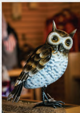
Metal Gray Horned Owl 4142 $27.95

Uniquely-cut poncho can be worn with a triangle or straight front or wrapped as a scarf. Features a timeless ombre-style print.