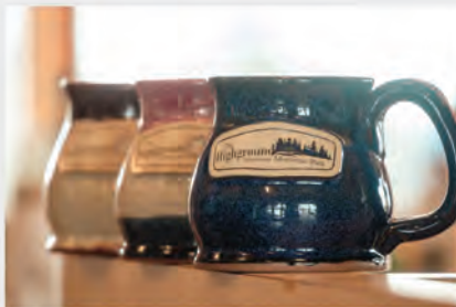
Potbelly Mug 830 $25.95

Beautiful metal craftsmanship and paint detail. Perfect for the garden, porch or deck.