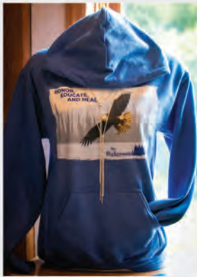
Eagle Hoodie 1135 $40.95

Hoodie with flying eagle and mission statement. Available in Heather Royal, Heather Navy and Sand.