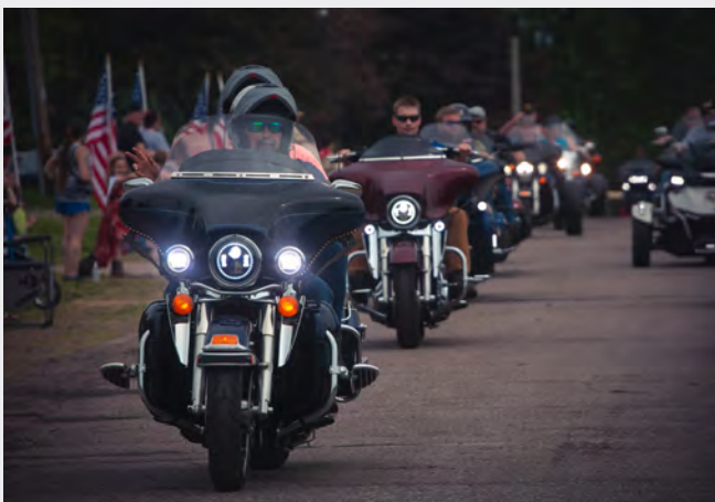
Supporters welcome riders to The Highground during the 13th Annual Honor Ride on Memorial Day.

The 14th Annual Memorial Day Honor Ride will be held on Monday, May 27, 2024. Supporters are encouraged to visit the Honor Ride website at thehighgroundhonorride.com and follow The Highground on Facebook at TheHighgroundVeteransMemorial for updates.