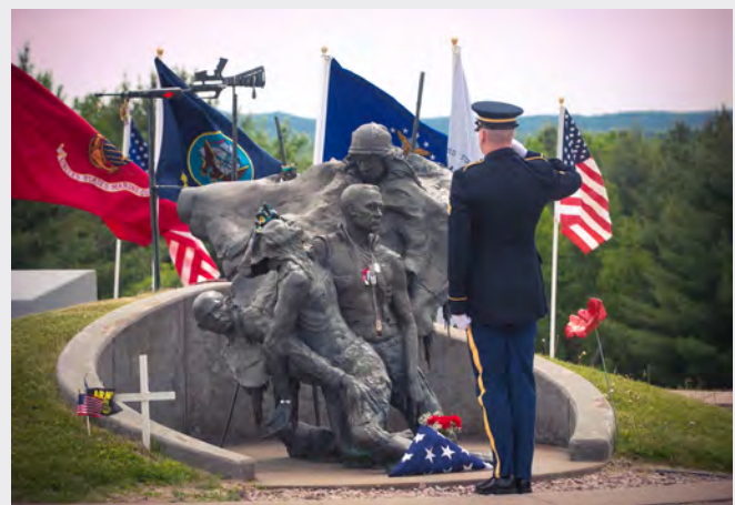
The Northwest Region Wisconsin Army National Guard Military Funeral Honor Guard folded a funeral flag and placed it at the base of the "Fragments" Tribute during the annual Memorial Day Ceremony.