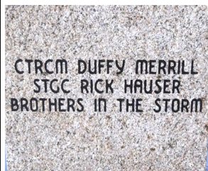
Persian Gulf (sand) $550

Legacy stones line the walkways of the plaza. 12"x12"x2"