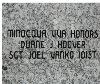
Legacy (gray) $495

Honorees may be a veteran or non-veteran, living or not, an individual or an organization involved in supporting these US troops. Funds are to help provide for future upkeep of the Park and remarkable tributes.