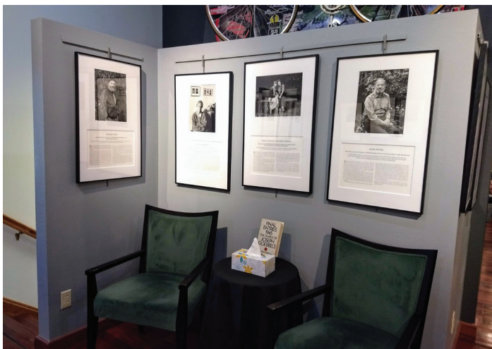
Exhibit Series being put together to honor service for Korea, Vietnam, and Global War on Terrorism

"Multiply by Six Million" includes 37 stunning black and white photographs and is accompanied by an emotional 24-minute DVD and an album of additional survivor portraits. The Interpretive text allows visitors to understand historical events in Europe, leading up to the Holocaust and contemplate current concerns about intolerance and genocide.