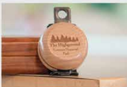
Wooden Yoyo 818 Kids will love this wood yoyo etched with The Highground Veterans Memorial Park logo. $5.95