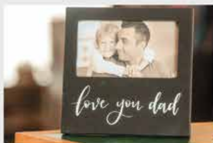
"Love You Dad" Frame 3132 Wooden picture frame with "Love you dad". Perfect for Father's Day or birthdays. $9.95