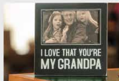
"My Grandpa" Frame 3131 Wooden picture frame with "I Love That You're My Grandpa" saying on it. $9.95