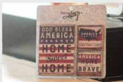
Patriotic Memo Set 1497 Wooden patriotic magnets. Set of three. $9.95