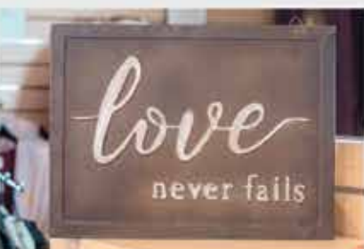
"Love Never Fails" 5265 Rustic metal wall sign with "Love never fails". $17.95