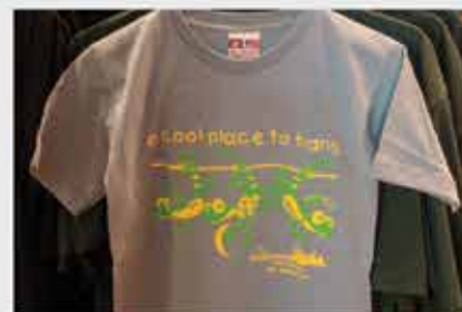
"Cool" Kids T-shirt 1011 Kids tee with "a cool place to hang" saying with green and yellow geckos. $19.95

GIFT SHOP SUMMER SALE - JUNE 17-19, 2021 15-60% off regular prices! Sweatshirts, t-shirts, wall decor and a variety of miscellaneous items. Mark your calendar!