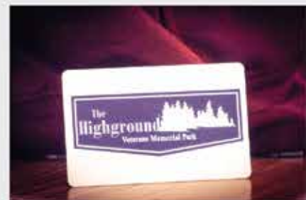
HG Gift Card

The perfect gift for anyone and any occasion. Available in any amount.