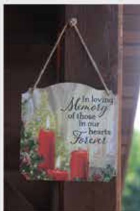
Metal Art Sign 5326

Decorative sign with candle image and "In loving memory" saying.