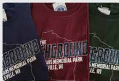
The Highground T-shirt 1145

The Highground t-shirt is available in maroon, navy blue and green. Kids sizes small (6-8) to XL (18-20).