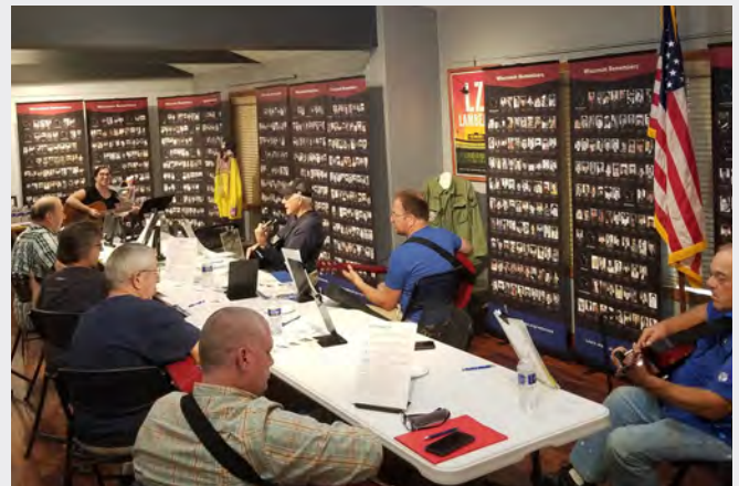
Veterans jammin' their guitars during the last Fall 2023 session