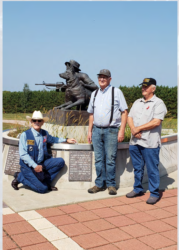
Summer 2023 Military Working Dog Ceremony

Honor Stone applications are available on our website, on the "Honor Stone" page, at thehighground.us/honor-stones . Apply online or print the application and mail it to: The Highground, PO Box 457, Neillsville, WI 54456