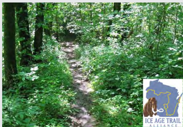
A photo of the Ice Age Trail near Holcombe