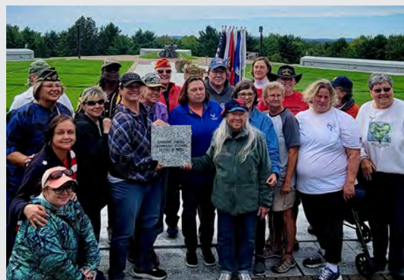
A photo of attendees taken at The Highground during the 2022 Female Retreat