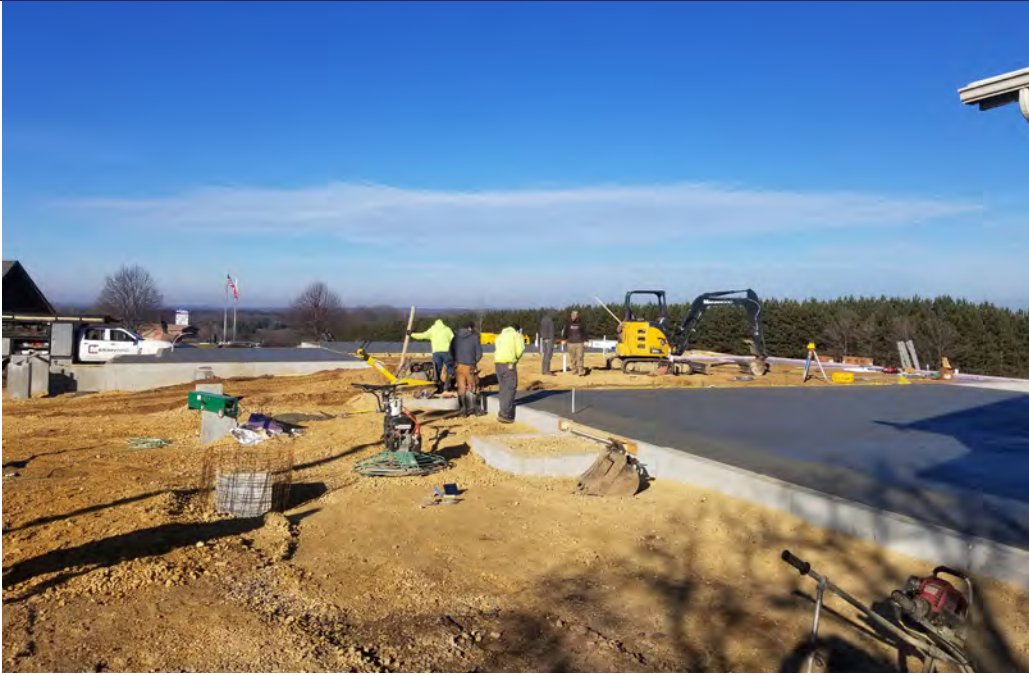
Construction on the expansion kicked off in December. Above, concrete is poured in early February.