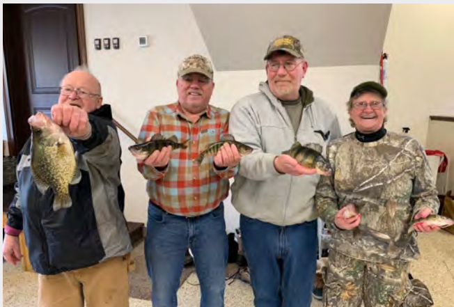
Veterans showing off their catch of the day!