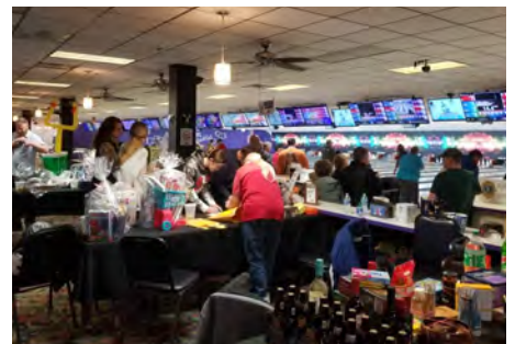
Bowlers, volunteers and raffle participants during Winter Bowl 2024