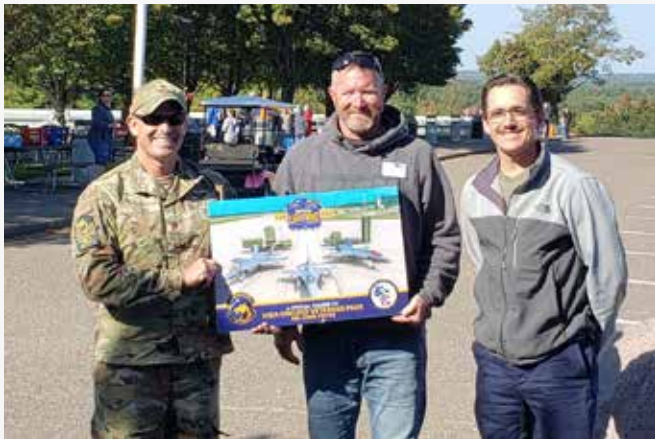
A special thanks to The Highground for their support of Volk Field's 2024 Northern Lightning exercises, which is a two-week joint training exercise held annually at the Volk Field Combat Readiness Training Center.

https://content.govdelivery.com/accounts/WIGOV/bulletins/3babccd