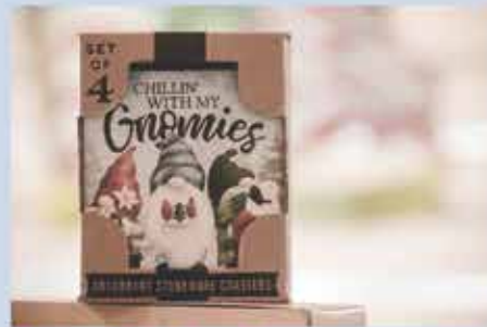
Gnome Coasters 3013 $12.95

Beautiful gold angel holding heart, 12" tall. 8" tall angel also available.