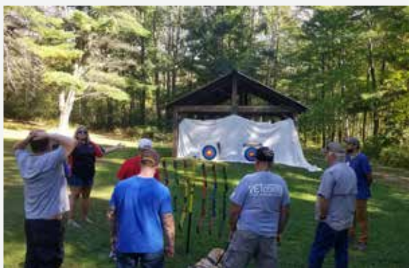
Archery workshop during the 2024 men's retreat

This year’s men’s retreat was an inspiring gathering filled with connection, camaraderie, and personal growth. None of it would have been possible without the generous support of our sponsors, to whom we owe our deepest gratitude.