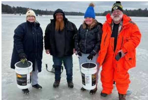
Veterans ice fishing during the 2024 winter retreat