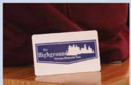
HG Gift Card The perfect gift for anyone and any occasion. Available in any amount.

Angel holding a bouquet of daisies with "You Are Loved" sentiment (pictured on the left).