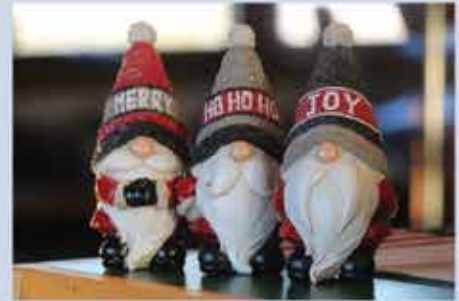
Holiday Gnome 5243 $9.95

Set of four gnome coasters, each with a different design. Measures 4" x 4". Pictured: "Chillin' with my Gnomies"