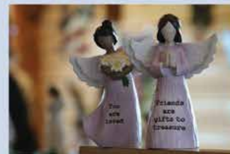
Angel Daisies Figurine 4300 $21.95

WillowTree Je t'aime (I love you) decorative figurine holding heart.