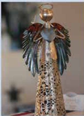
Metallic Angel Decor 4036-02 $27.95

Beautiful gold angel holding heart, 12" tall. 8" tall angel also available.