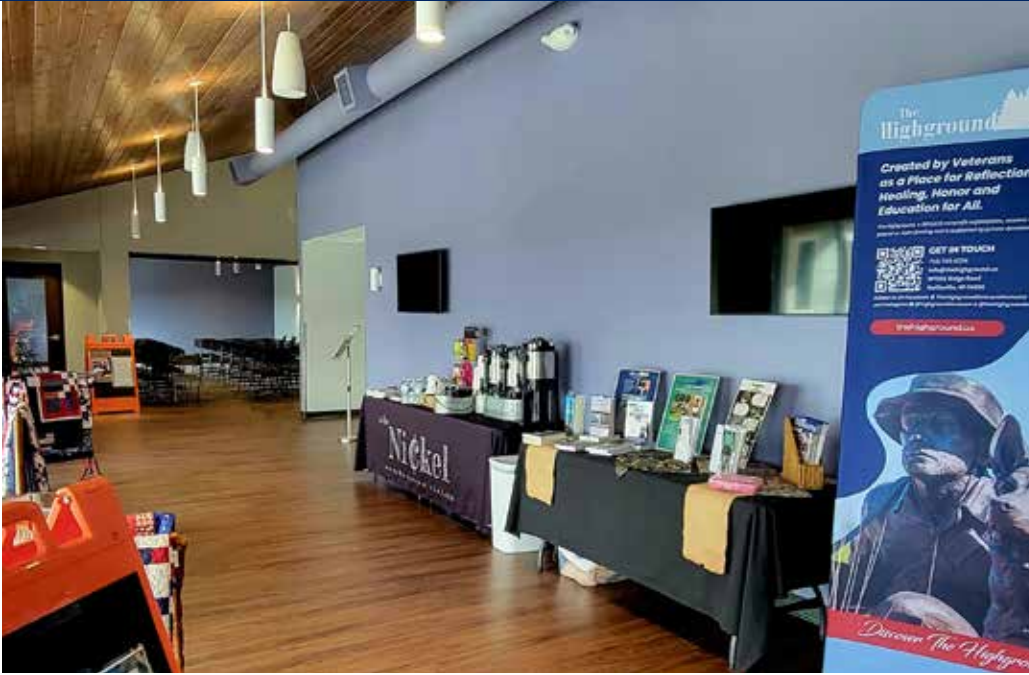
Veterans and visitors who attended the Veterans Day gathering enjoyed a sneak peek of the new Welcome Center