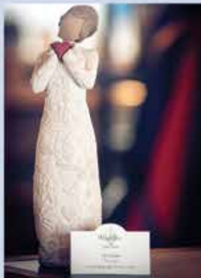
Je t'aime Figurine 9021 $32.95

Add some holiday cheer with one, or all three, of these cheery gnomes. They are all dressed up and filled with the spirit of the holidays!